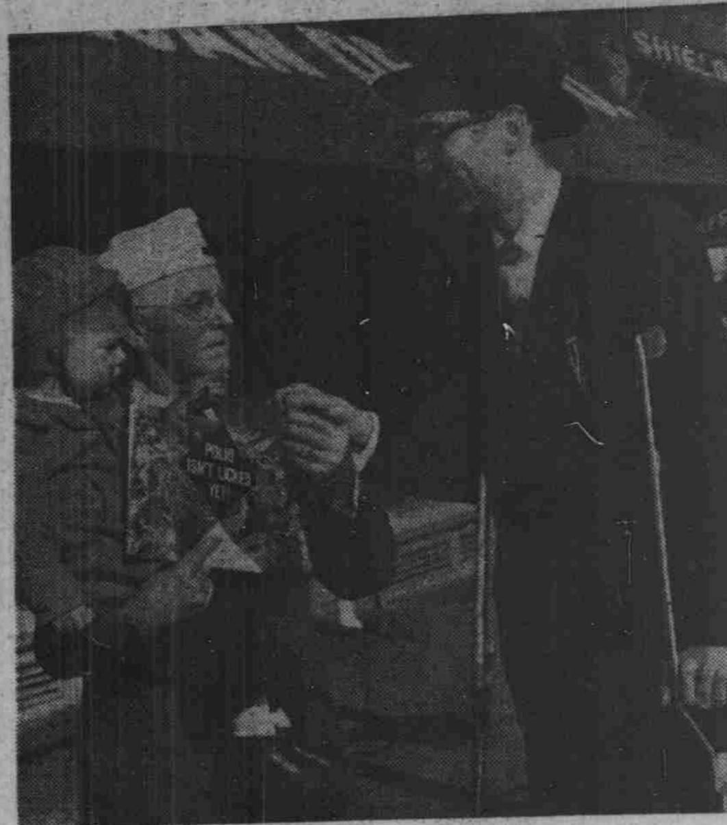
Setting Up Crutch Day

Same day service Speedee Laundry and Cleaners 104 W. Franklin St.