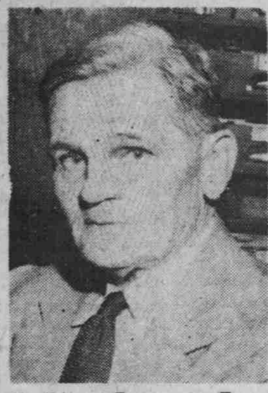
To Direct European Tour