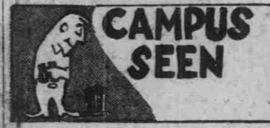
CAMPUS SEEN In classes: an "educated" squirrel visiting a freshman English class every morning at 8 o'clock.