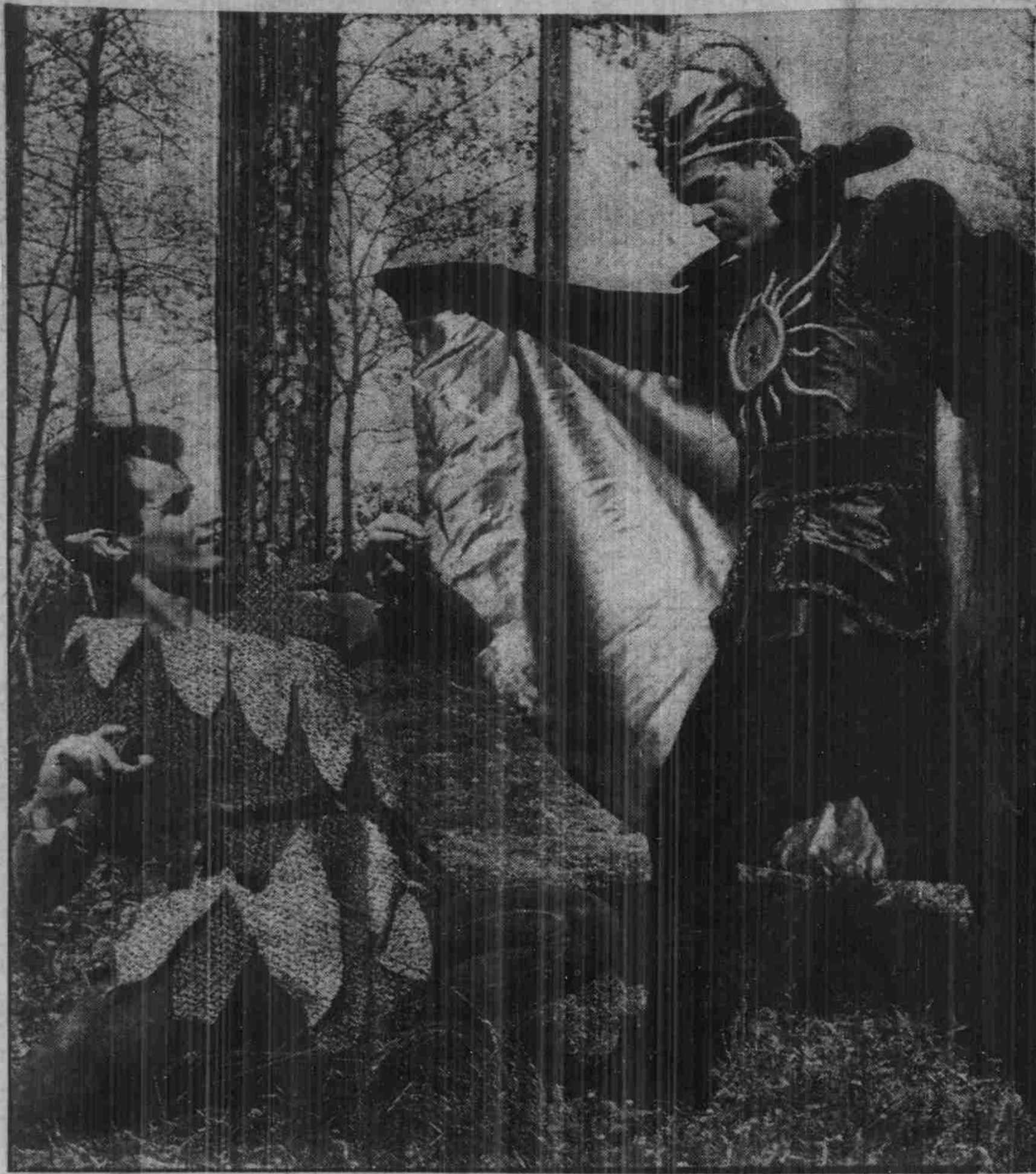
Playmakers Perform This Weekend