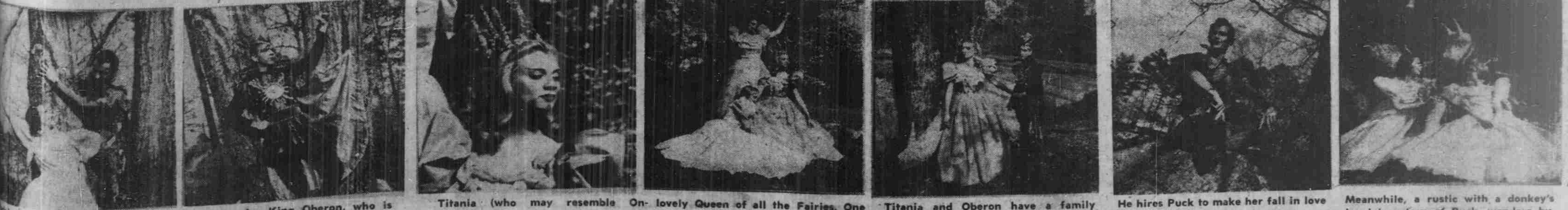
... is a mischievous sprite who teases the village girls... He works for King Oberon, who is lucky enough to be married to... Titania (who may resemble the lovely Queen of all the Fairies, Oberon's wife)... Titania and Oberon have a family quarrel. To divert attention... He hires Puck to make her fall in love with the first person she sees... Meanwhile, a rustic with a donkey's head (courtesy of Puck, wanders by...