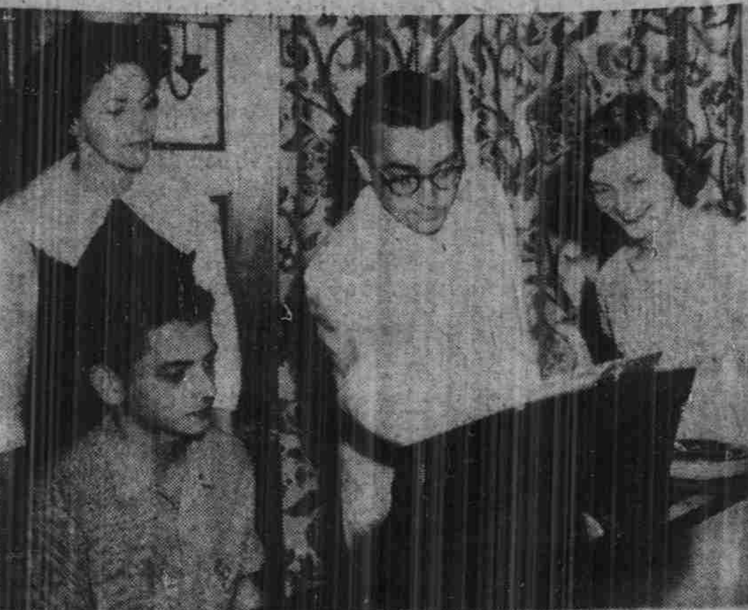
Sunday's Petite Musicale Performers

A softball game, followed by an entertainment interlude by group of dorm musicians will supplements of the magazine. round out the activities phase of the barbecue. An abundance of food is expected to complete the program for Alexander residents and their guests.