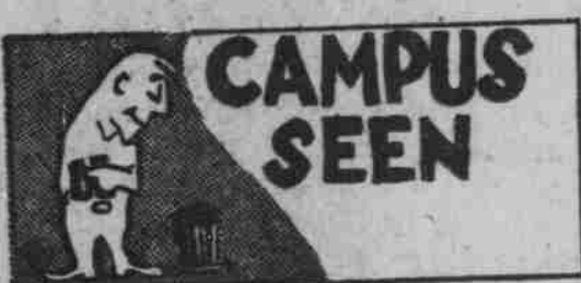
Caroline Coed seen carrying Carolina Gentleman's football equipment near Woollen Gym.