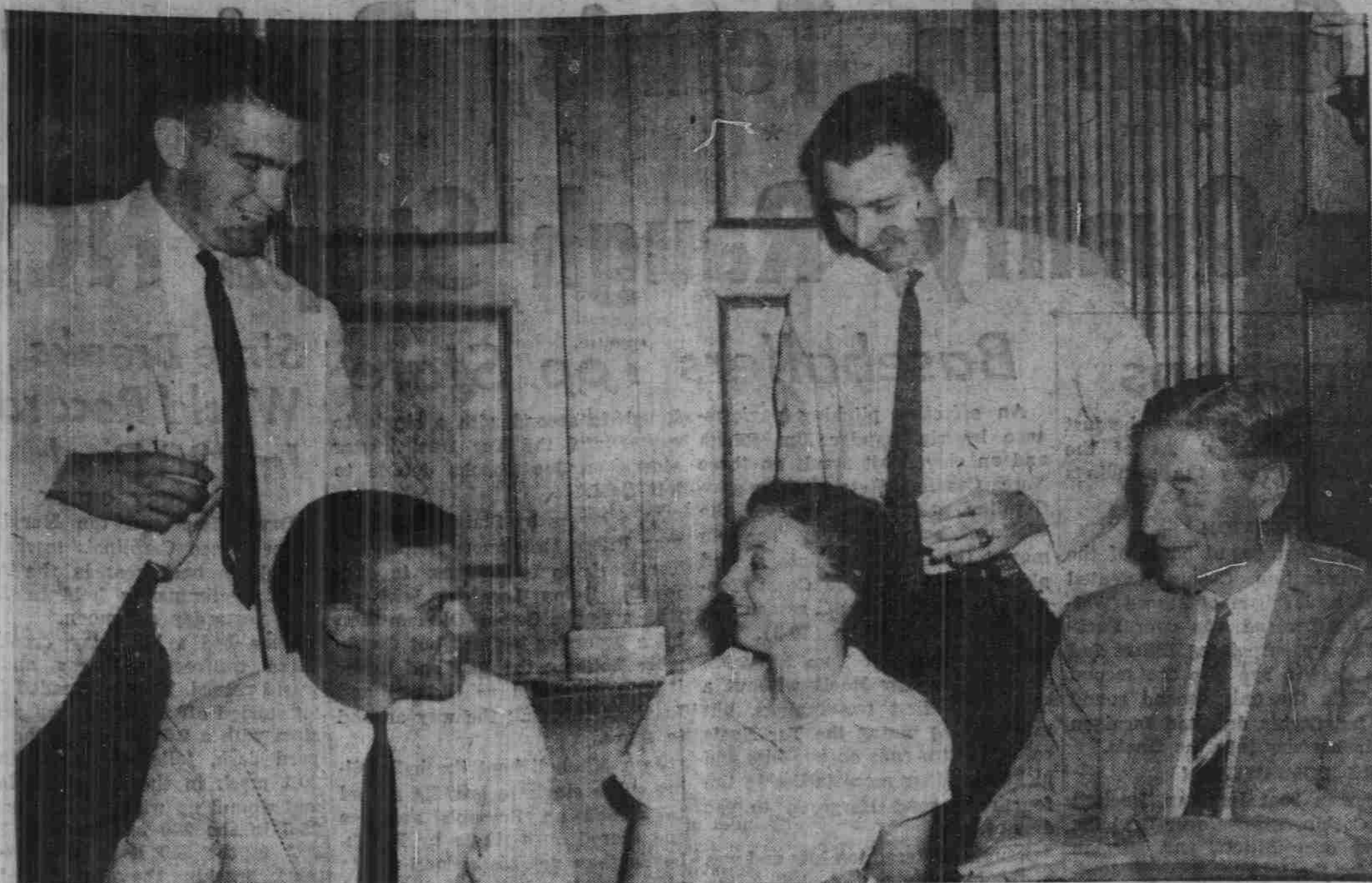
Old Well Officers Pose

Boston 16, 21 Marlborough St. New York 17, 230 Park Ave. Providence 6, 150 Angell St. Montclair, N.J., 32 Plymouth St.