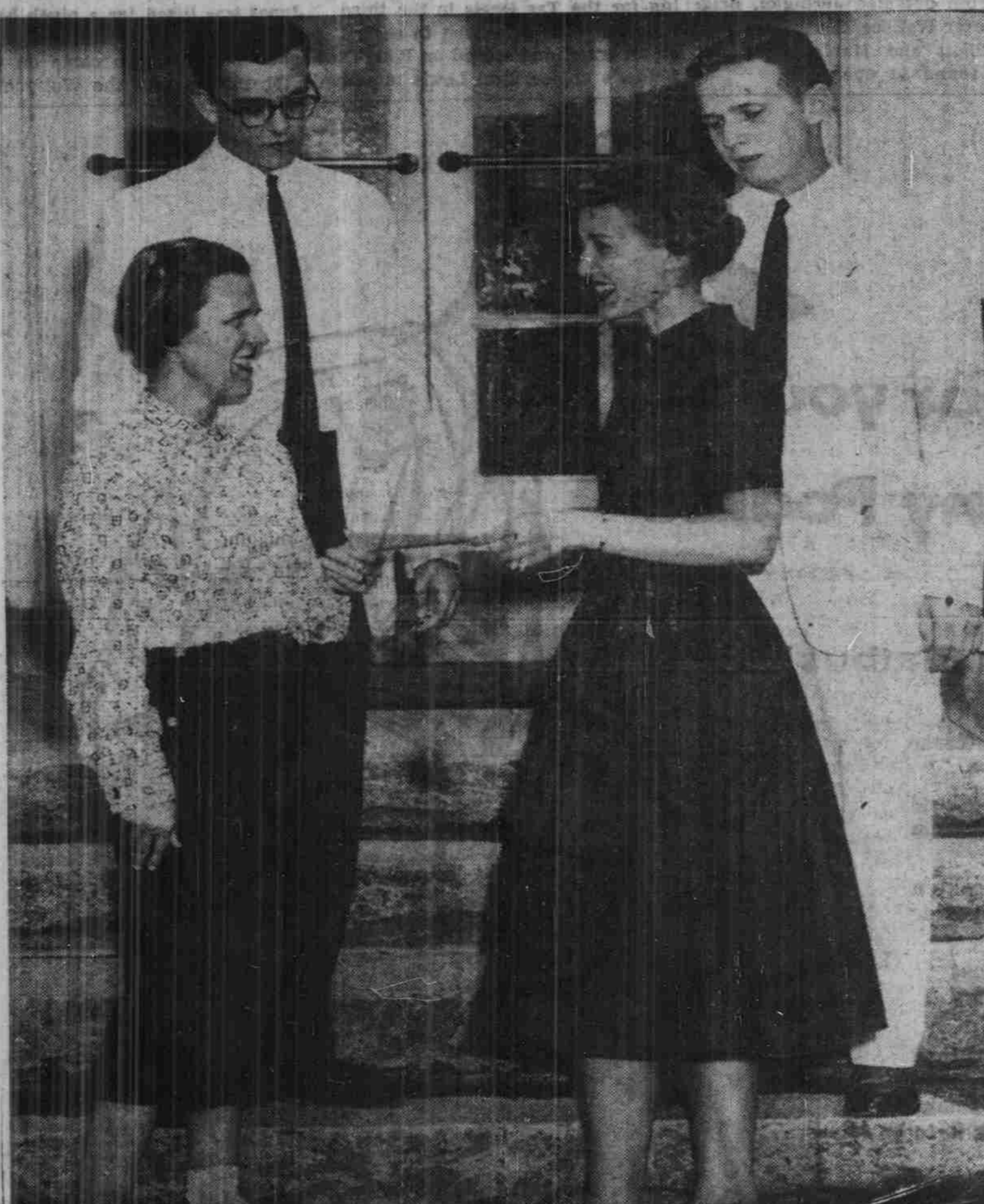
Benefit Check Given to REC

FOR THE FINEST IN AFTER - SIX FOR SALE OR RENT VARLEY'S