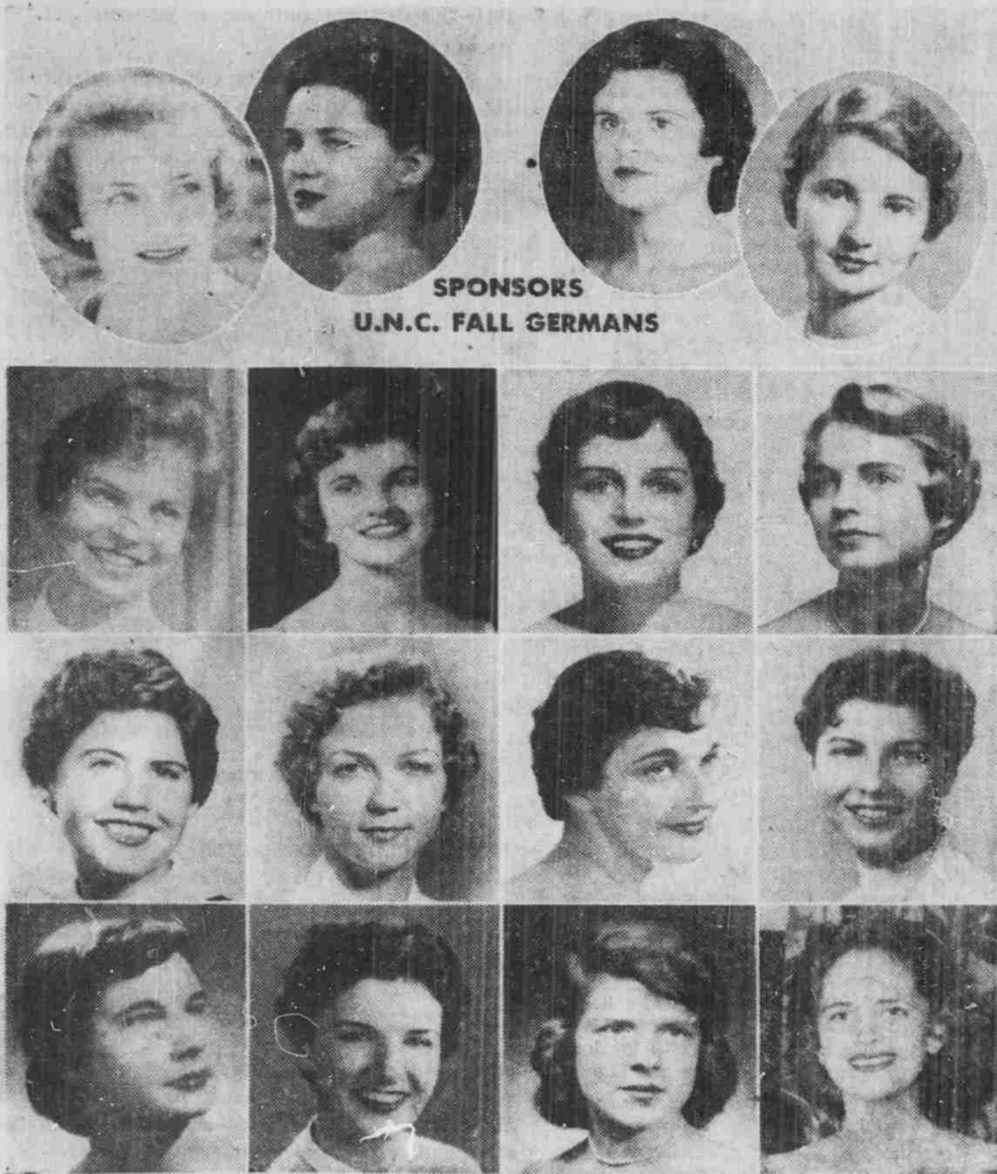
SPONSORS U.N.C. FALL GERMAN