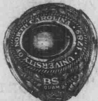
(By JOHN ROBERTS MFG. CO.)