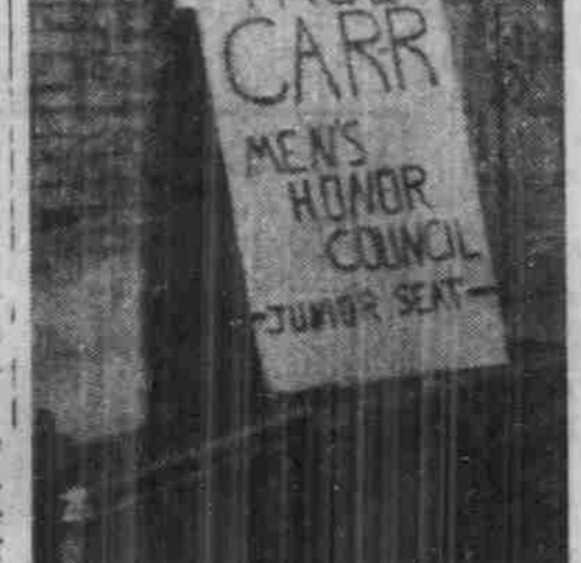
DELINQUENT POSTER . . . in Y Court

Undersecretary of State Herbert Hoover Jr. modified this stand somewhat, however. He said the United States would send oil to the 17 affected countries in western Europe only when they would advise Washington how much they needed and who needed it.