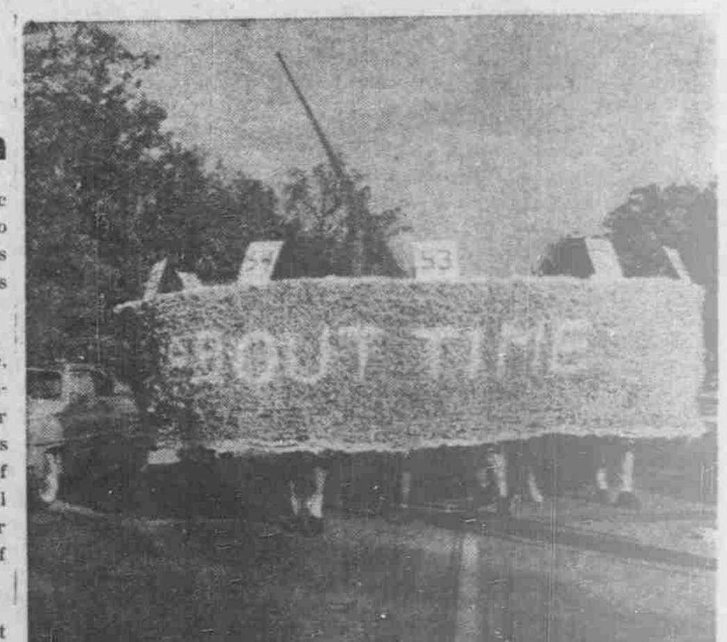
Phi Delta Theta Float