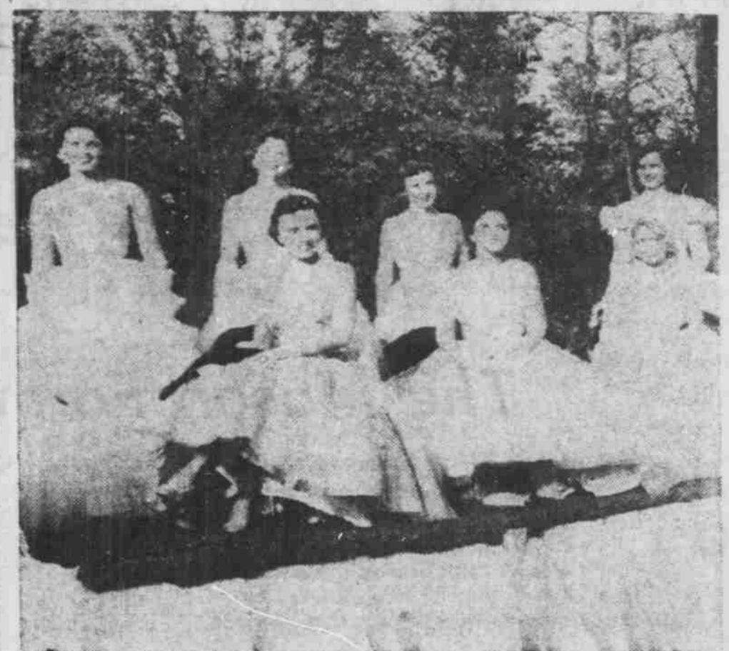
The Queen and Her Court

Today is the last issue of The Daily Tar Heel until after the holidays. The next issue will appear Tuesday.