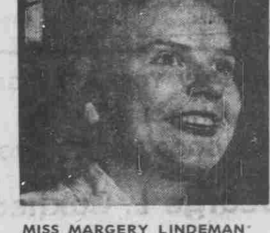
A Senior From Virginia Beach, Va.,