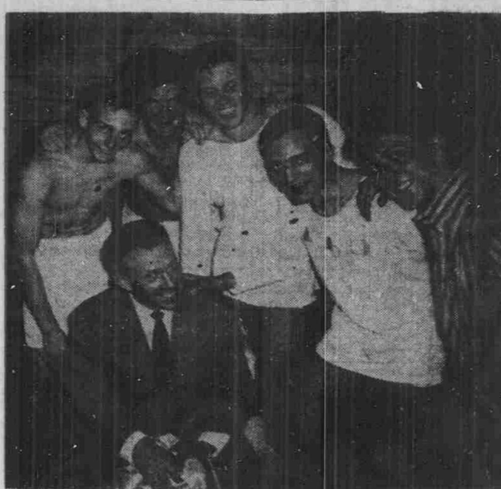
A Smile For The Cameraman

Armour Meats And Long Meadow Dairy Products