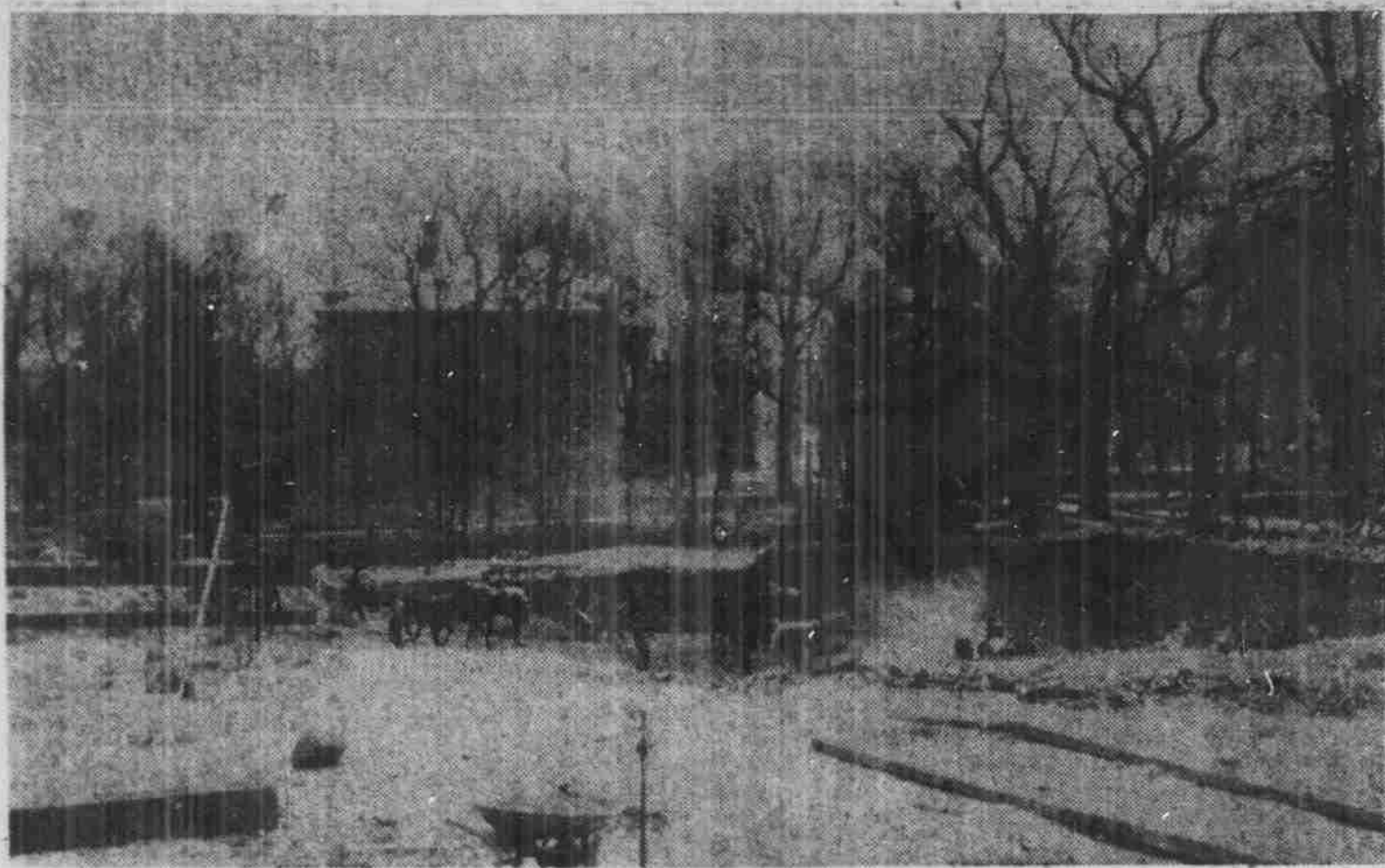
SO LONG AGO ...the age of mechanization had not arrived in 1924