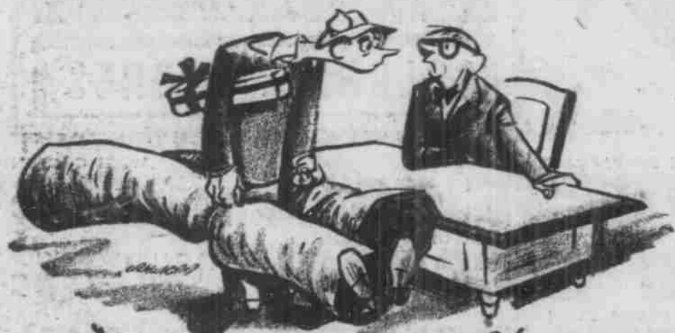
"What are those three packages?"

"Good evening, sir," said Student Sigafoos. "I am come so that you may get to know me better and thus help me solve the vexing problems that trouble me."