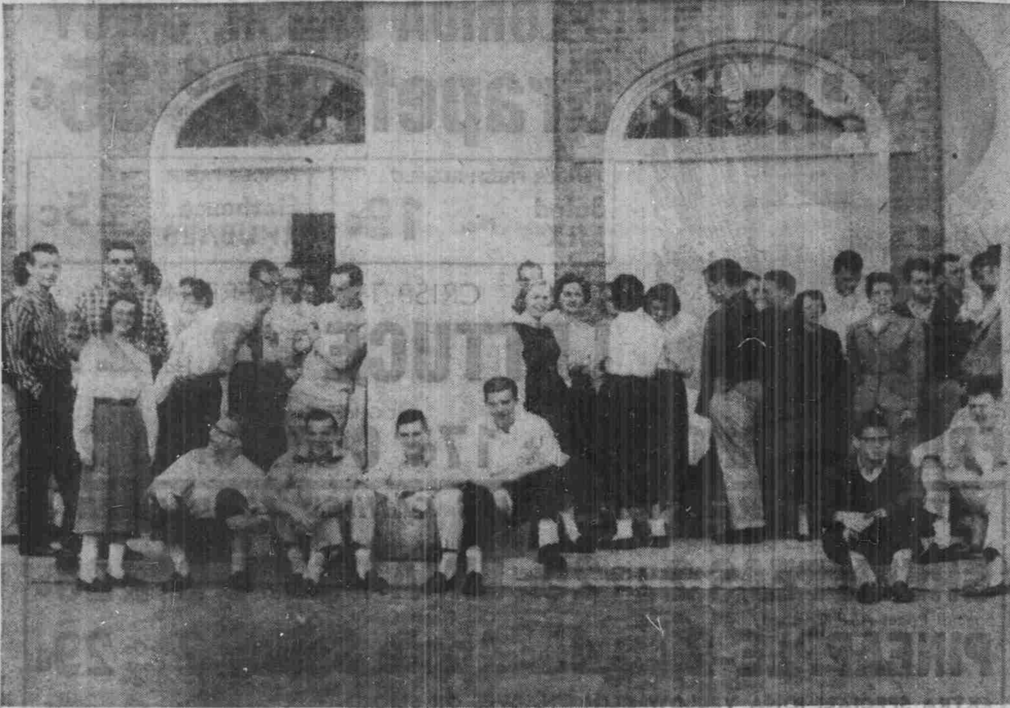
FOR SO MANY PEOPLE ...and these are but a few