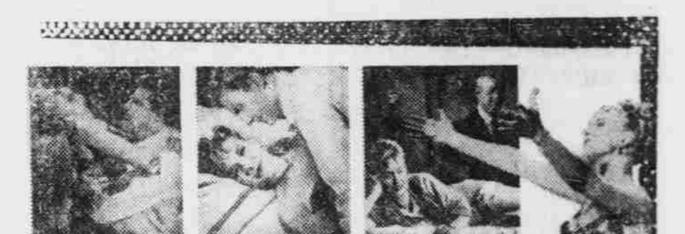
The strangest true experience a young girl in love ever lived!