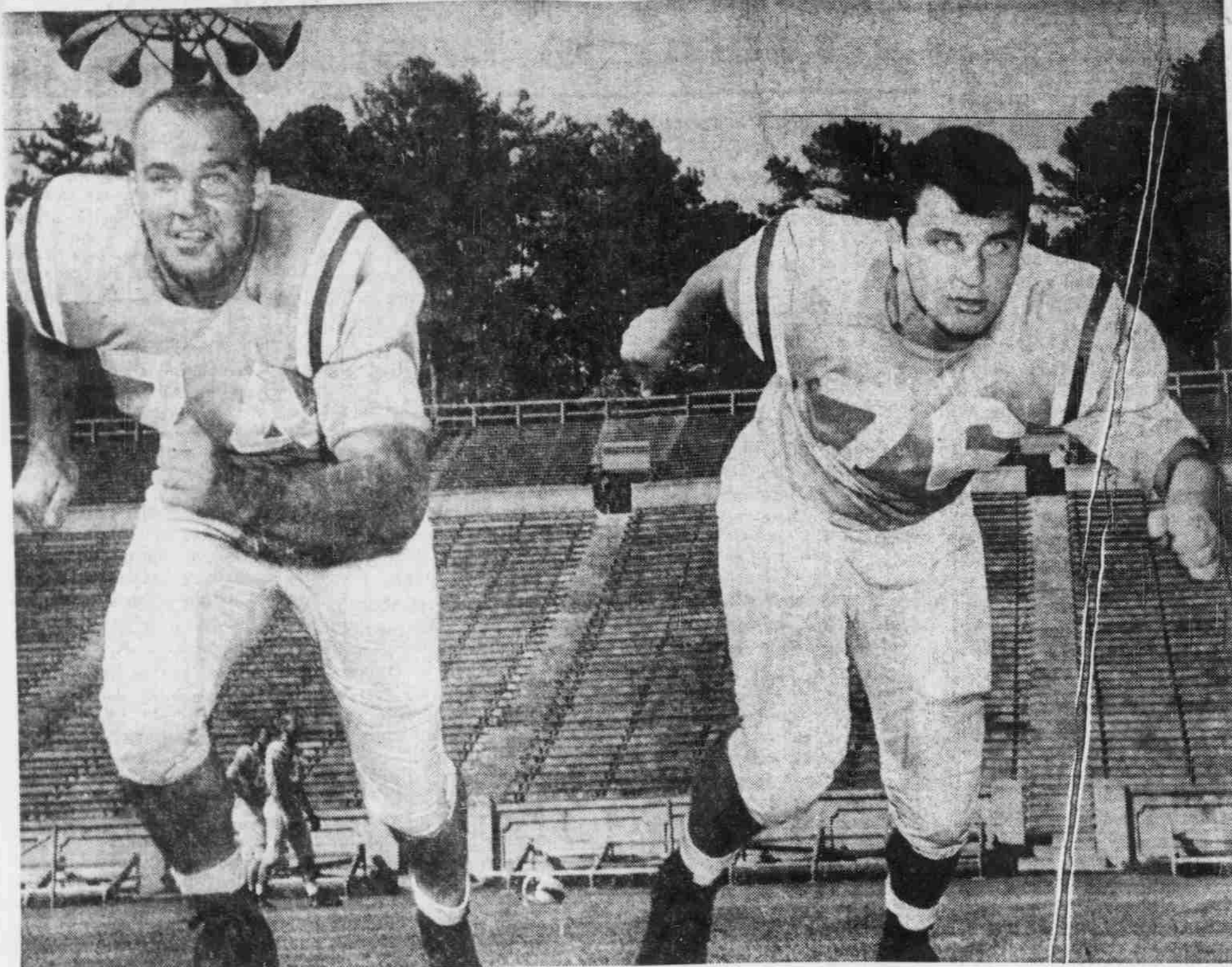
BIG RUGGED TACKLES

Philadelphia leaves tomorrow for pre-season training at Hershey, Pa.