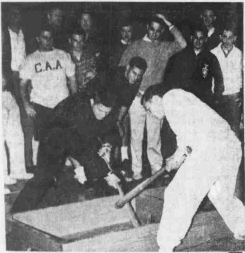
CO-RECREATIONAL CARNIVAL—Among the leading events at last night's co-rec carnival, box-hockey was one of the fastest and most enjoyable. A large crowd was on hand for the carnival.