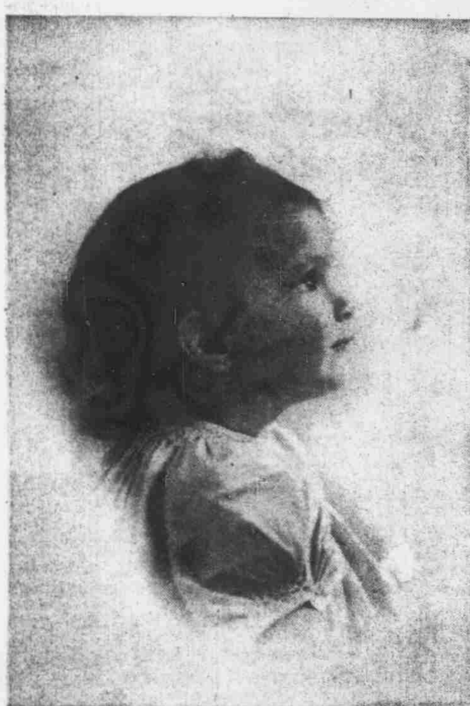
Yes, Virginia, There Is A Santa Claus

Disability WASHINGTON, Dec. 18. —Sen. Ervin (D-NC) said today the problem of presidential disability will be studied seriously by Congress next year. Such study is urgent, he said, because of the illness of President Eisenhower. In a letter to constituents Ervin