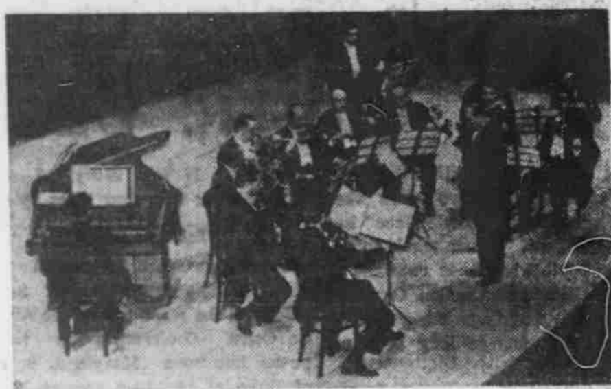
VIRTUOSI DI ROMA ENSEMBLE To Give Concert Here Thursday Night

Interviews for prospective members of the Campus Orientation Committee will be held in the Woodhouse Conference Room at Graham Memorial today and Friday from 2-4 p.m.