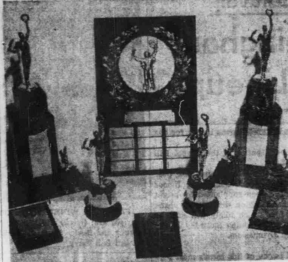
JAMBOREE TROPHIES—These are only one-half of the trophies which will be awarded to the winners in the First Annual Grial-Mural Sports Jamboree to be held next week (March 4-5) in Woolfden Gym.

tion," a Congregational magazine. He was appointed professor of religion at Smith College in 1953. While serving there, he was radio, movie, television editor for "Episcopal Church News" and a regular contributor to "The Reporter Magazine."