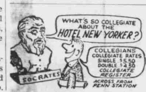
WHAT'S SO COLLEGIATE ABOUT THE HOTEL NEW YORKER? COLLEGIANS COLLEGIATE RATES SINGLE $5.50 DOUBLE $4.50 COLLEGIATE REGISTER ACROSS FROM PENN STATION