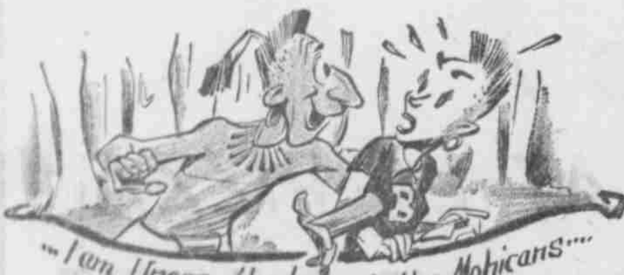
"I am Uncas, the last of the Mohicans!"

The reverse wedgie is simply a wedgie turned around. This tilts a girl backward at a 45 degree angle and cuts as much as three feet off her height. It is, of course, impossible to walk in this position unless you have support, so your date will have to keep his arm around your waist at all times. This will tire him out in fairly short order; therefore you must constantly give him encouragement. Keep looking up at him and batting your lashes and repeating in awed tones, "How strong you are, Shorty!"