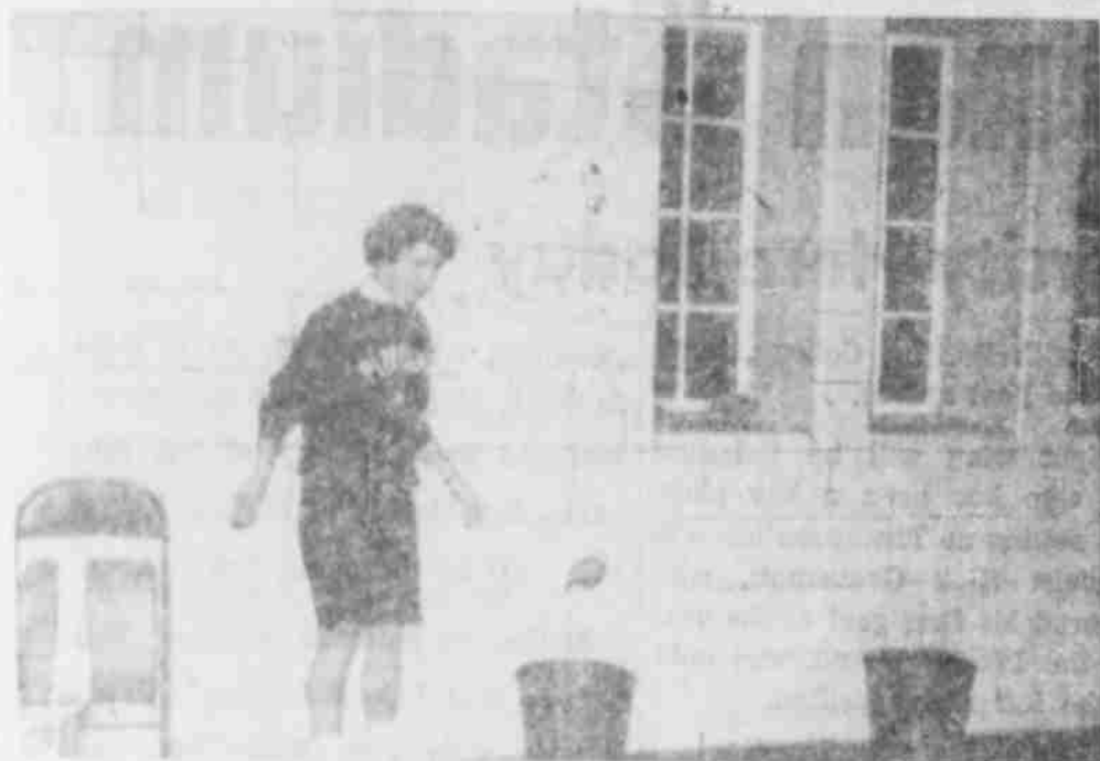
CARNIVAL BEAN BAG TOSS ... coed matches, will it go in?