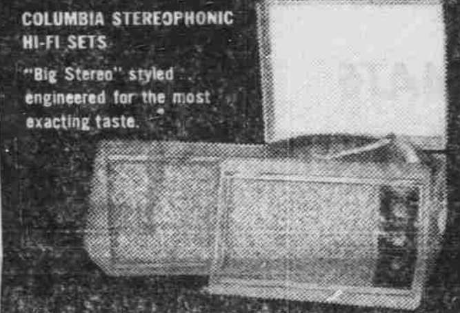
COLUMBIA STEREOPHONIC HI-FI SETS "Big Stereo" styled engineered for the most exacting taste.