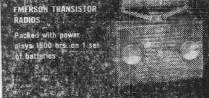
EMERSON TRANSISTOR RADIOS Packed with power plays 1600 hrs. on 1 set of batteries.