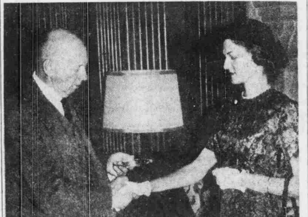
Jane C. Gray Award Presentation