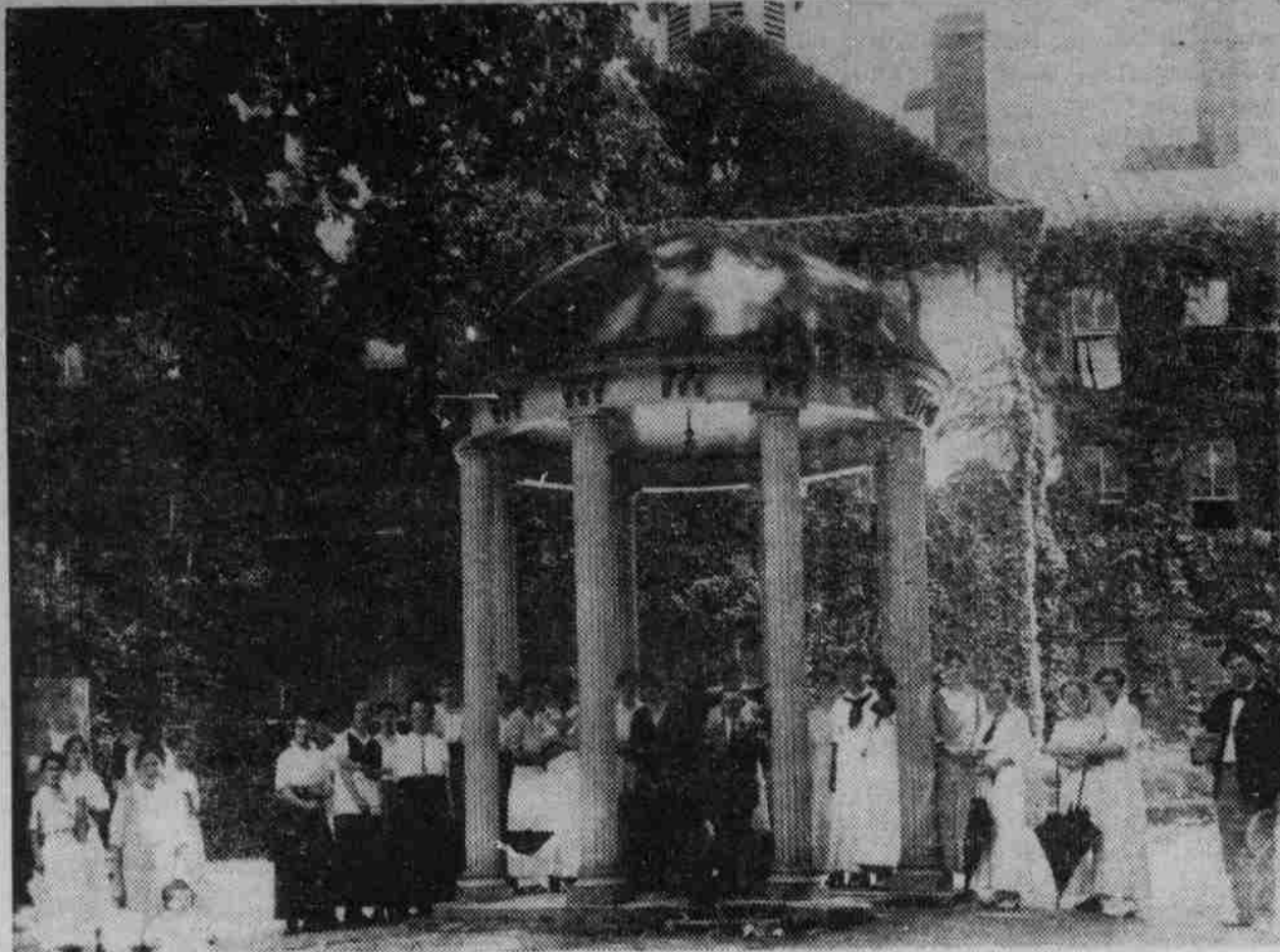
HERE IS A GATHERING at the Old Well in Chapel Hill about 50 years ago. The University has the oldest summer school in the nation.