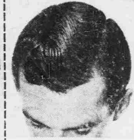
Penetrating Wildroot Cream-Oil

"Surface" hair tonics merely coat your hair. When they dry off, your hair dries out, But the exclusive Wildroot Cream-Oil formula penetrates vour hair. Keeps hair groomed longer...makes hair feel stronger than hair groomed an ordinary way. 'There's no other hair tonic formula like it.