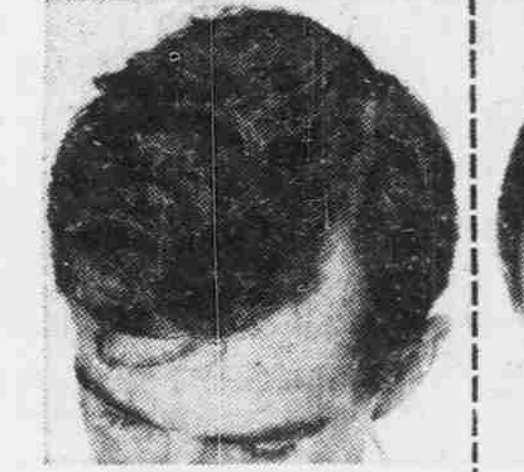
"Surface" Hair Tonics