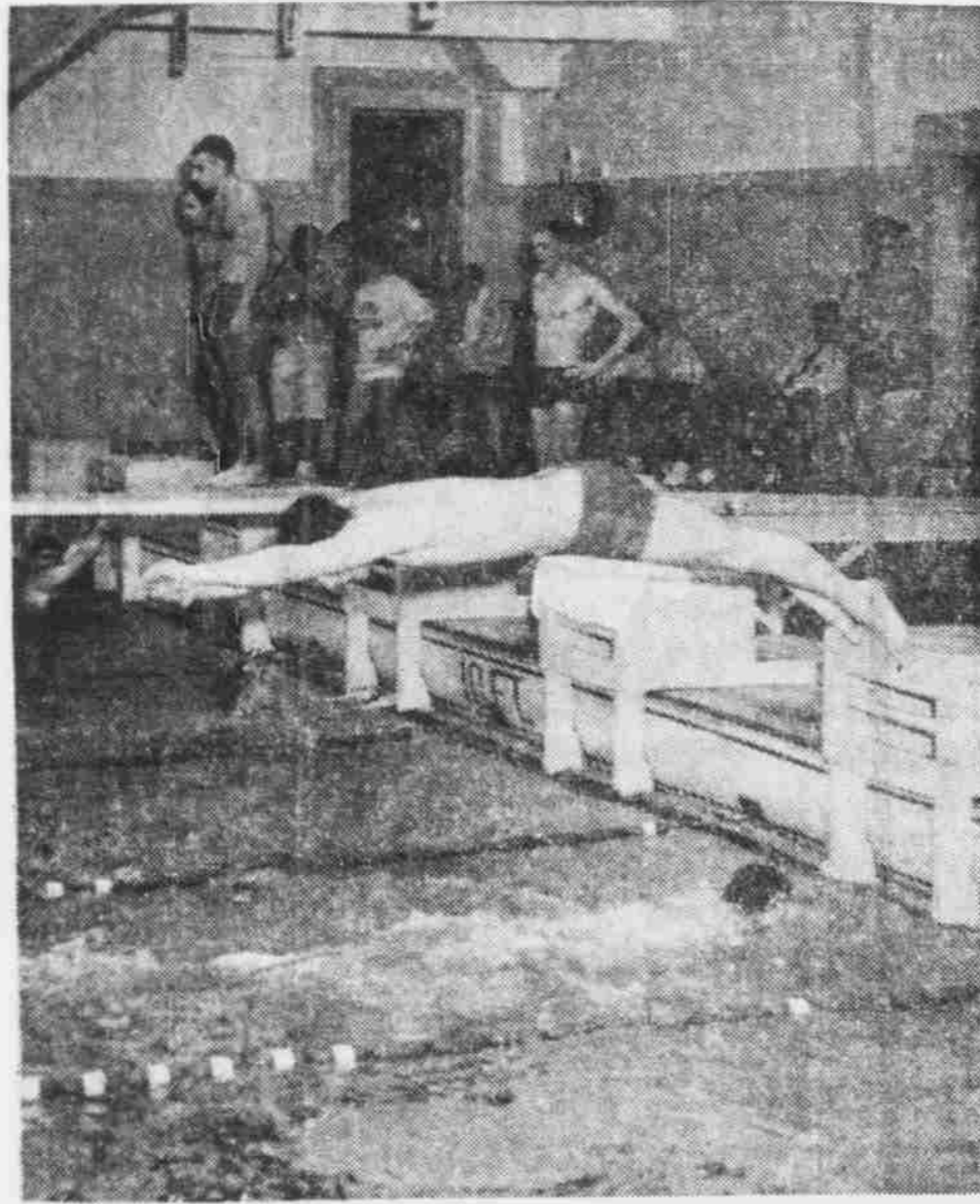
ACTION DURING THE 400 FREESTYLE RELAY EVENTS WHICH CLIMAXED YESTERDAY'S SWIMMING MEETS