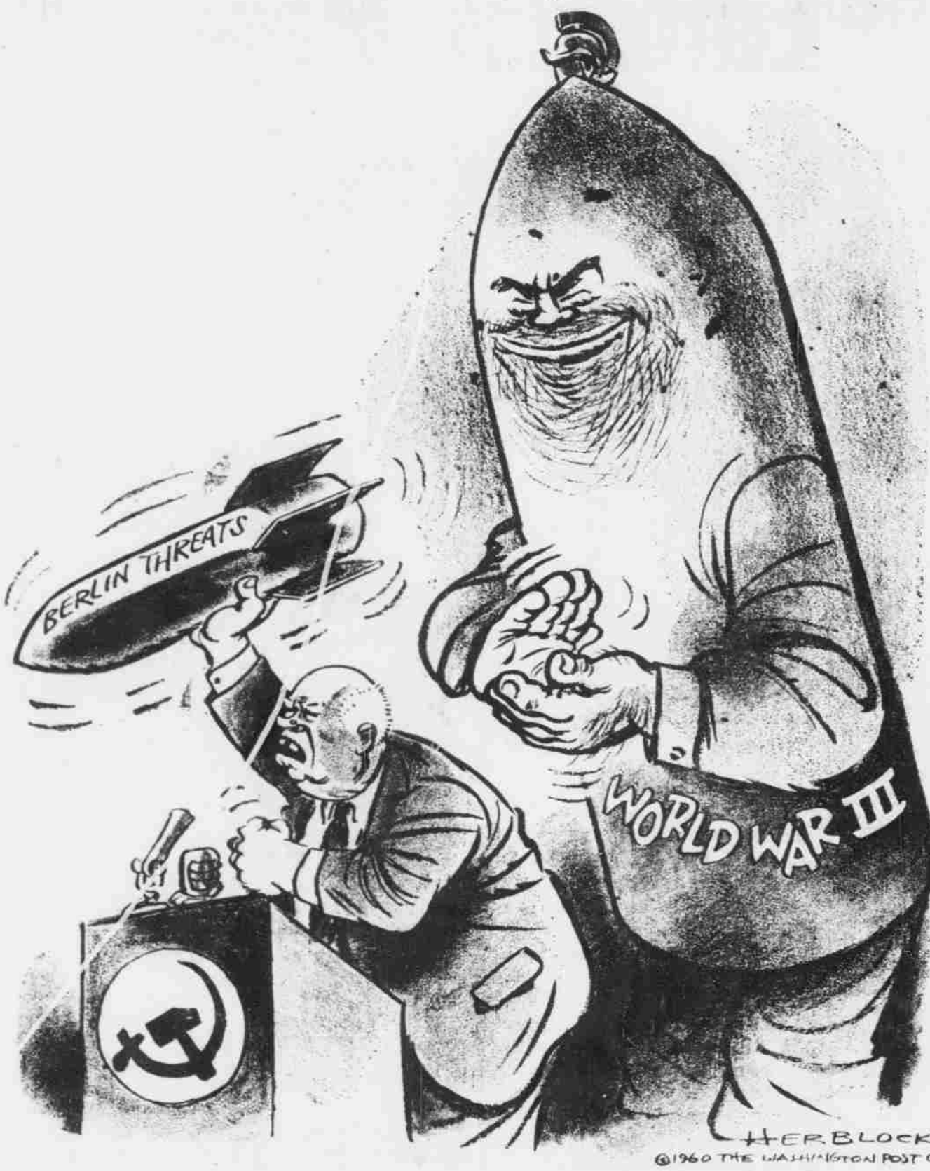
HER BLOCK ©1960 THE WASHINGTON POST CO.