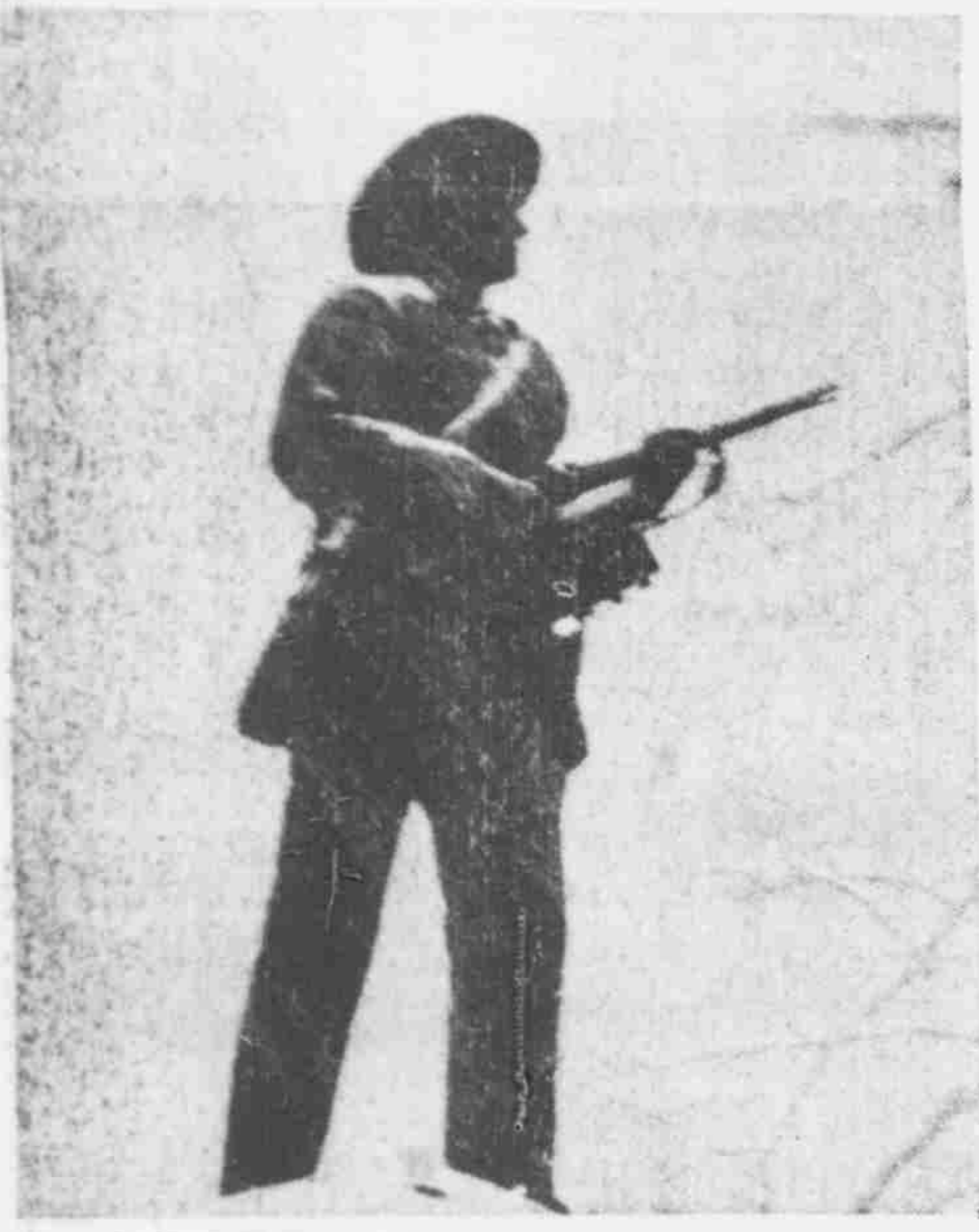
SILENT SAM — Undaunted by the snow, stands firm.

If you haven't received your copy yet, they will be distributed again Monday from 1:30-3:30 p.m. from the Rendezvous Room windows.