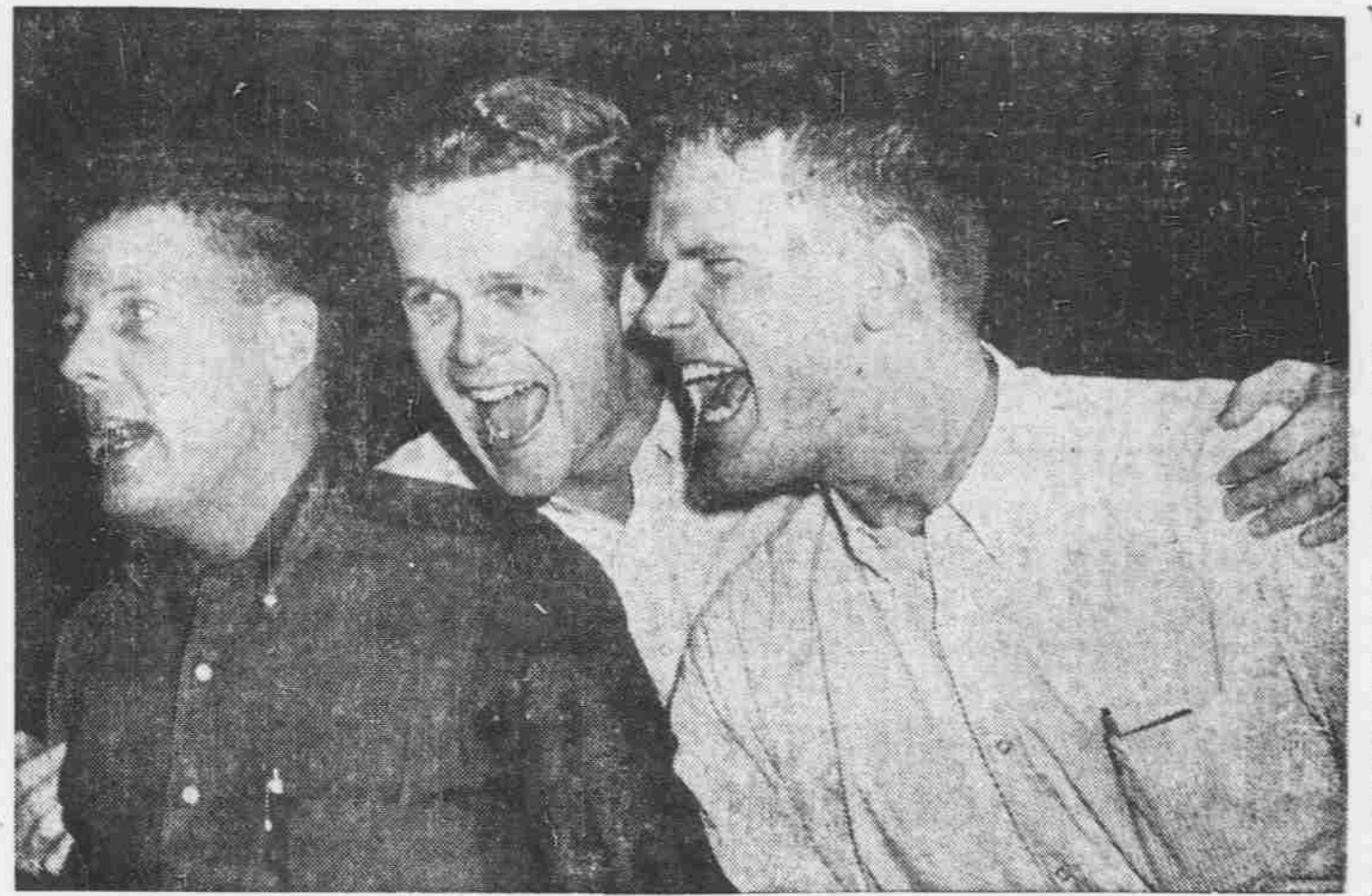
KINGSTON TRIO — Filled Memorial Hall to the gills.