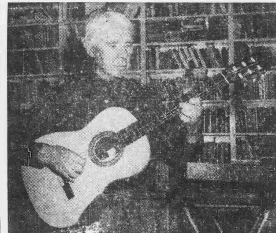
CARL SANDBURG — Never made it.