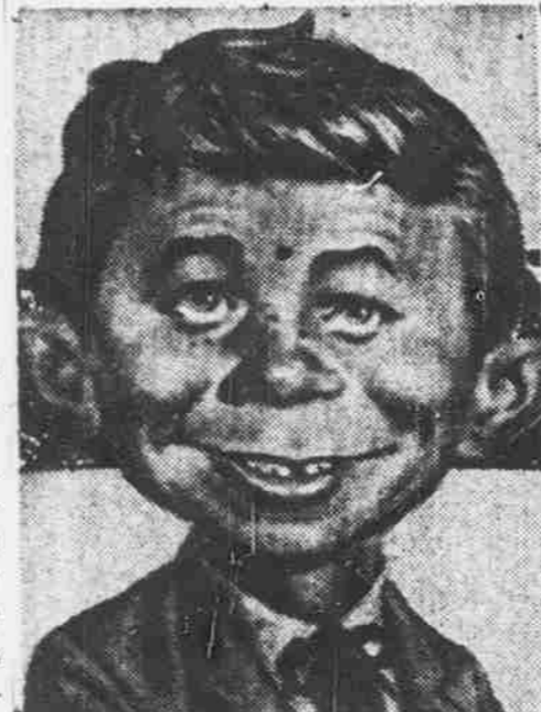
"SEE YOU NEXT YEAR"