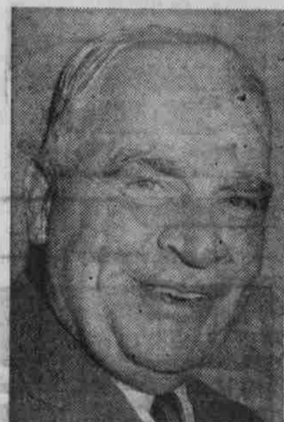
Gov. Luther Hodges

Though it was a rather warmish Sunday afternoon, most of the graduating seniors seemed not to mind the heat too much—they just wanted to get that sheepskin.