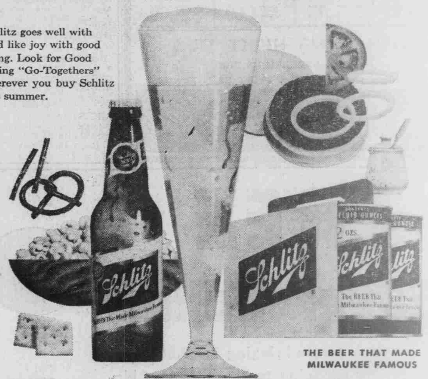
THE BEER THAT MADE MILWAUKEE FAMOUS

Schlitz goes well with food like joy with good living. Look for Good Living "Go-Togethers" wherever you buy Schlitz this summer.