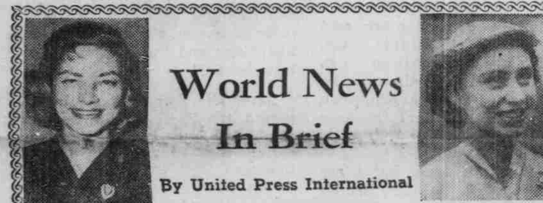
World News In Brief