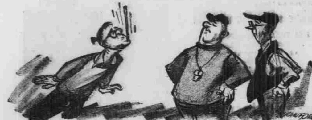
He had, alas, only a single athletic skill.

Leonid, the son of an upholsterer in Stratinated Circumstances, Idaho, had his heart set on going to college, but his father, alas, could not afford to send him. Leonid applied for a Regents Scholarship, but his reading speed, alas, was not very rapid—two words an hour—and before he could finish the first page of his test the Regents had closed their brief cases and gone home. Leonid then applied for an athletic scholarship, but he had, alas, only a single athletic skill—balancing a stick on his chin—and this, alas, aroused only passing enthusiasm among the coaches.