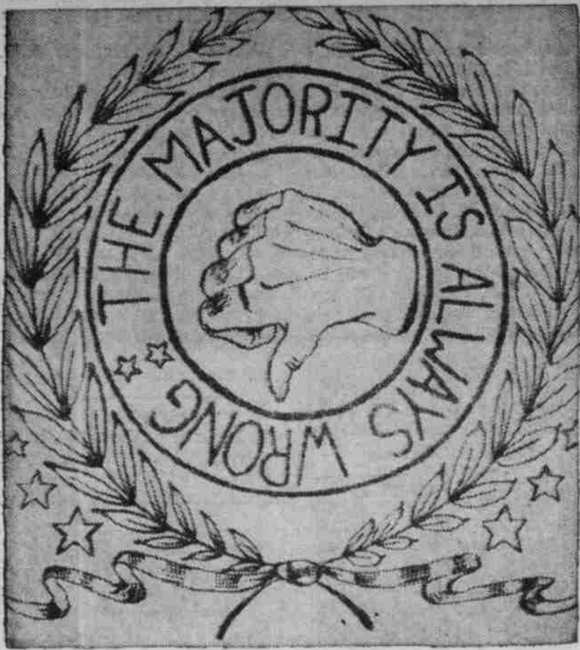
THE FINAL WORD — (Art by Katherine Strong)