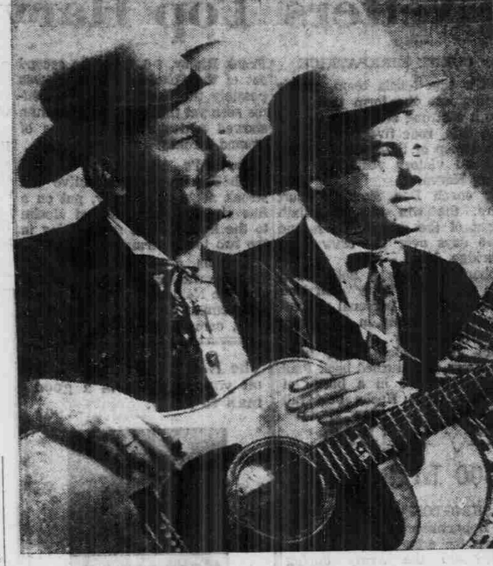
Lester Flatt and Earl Scruggs

Bouzareah followed Monday night's So let it rain! New rainy day mortar shelling of the Algiers apparel offers added beenfits in Casbah in which seven Moslems durable water repellency and easy