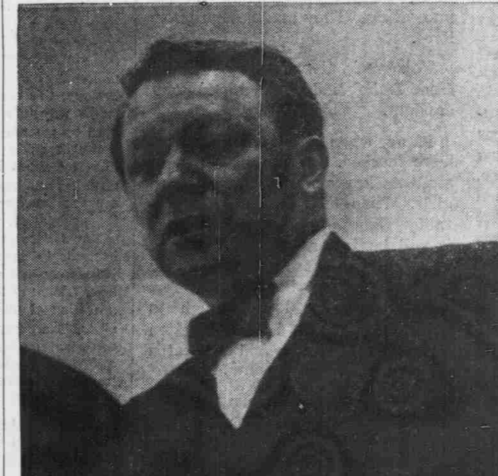
JAMES "SCOTTY" RESTON , of the Washington Bureau of the New York Times, speaks to a group of journalism and political science students in Howell Hall.