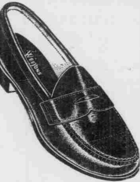
Brown and black round toe—most sizes.

LADY MILTON SHOP Milton's Clothing Cupboard