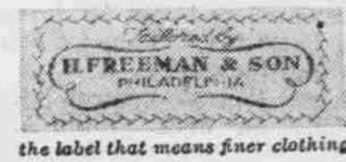
the label that means finer clothing

... is modern, relies on the classic to give his wardrobe meaning. One classic he wouldn't be without a Worsted Cheviot Suit. Likes its strong fine Cheviot "hand" — its lean natural tailoring, its traditional herringbone patterns. Finds just the classic he's looking for in our vested Cheviot collection. New colours in Smoke Blue, Grey Heber, Moorit Brown & Olive Mix.