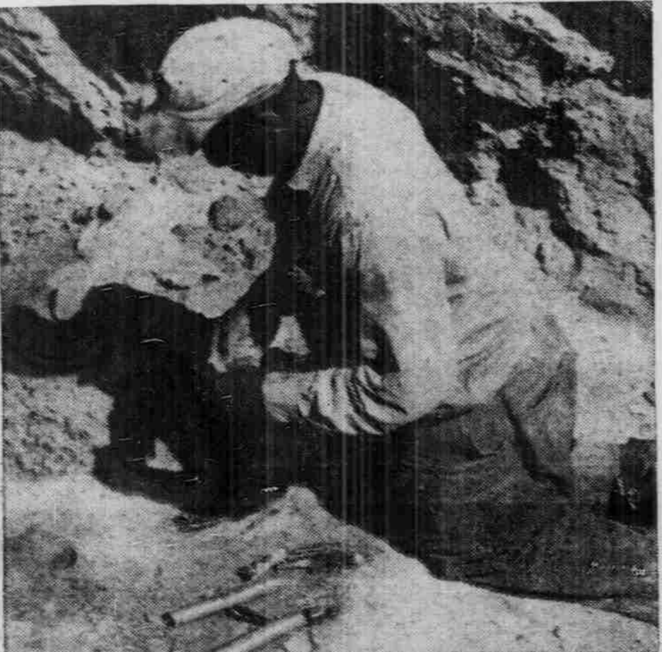
KENAN STADIUM—Construction workers digging the foundations for the addition to Kenan Stadium ran into a layer of rock last week and had to blast. Above, a workman places the dynamite.