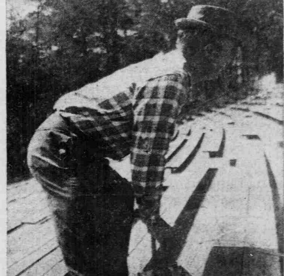
... and a "dynamite mat" is lowered into the foundation to prevent the explosion from throwing rocks out of the area. Then, the wires are connected to the detonator and the blast is set off... leaving rubble.