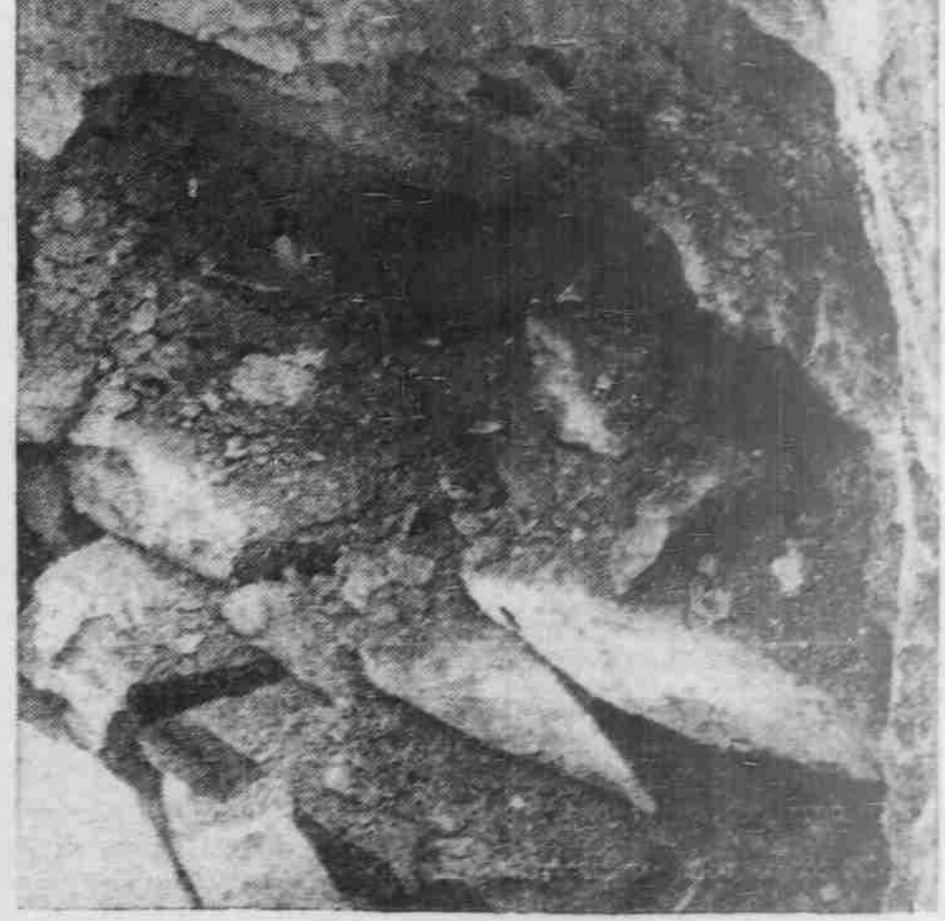
... and a "dynamite mat" is lowered into the foundation to prevent the explosion from throwing rocks out of the area. Then, the wires are connected to the detonator and the blast is set off... leaving rubble.