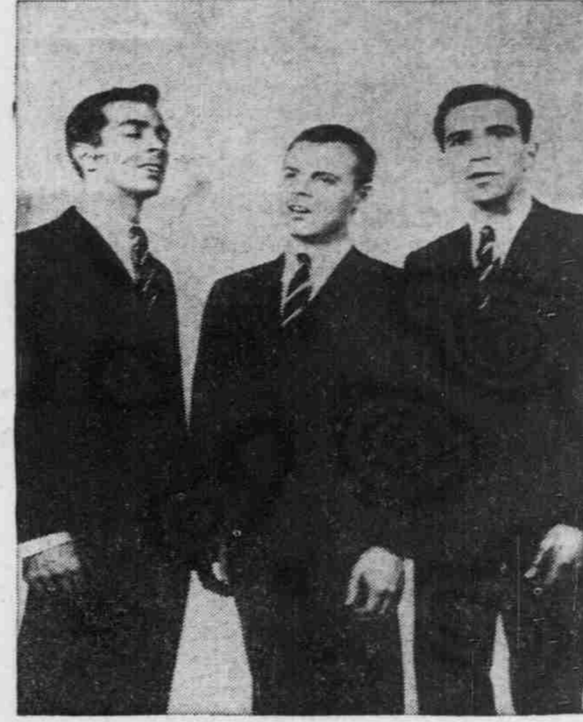
Chad Mitchell Trio