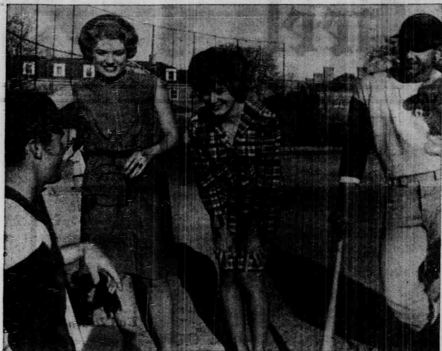
New Clothes And The National Sport