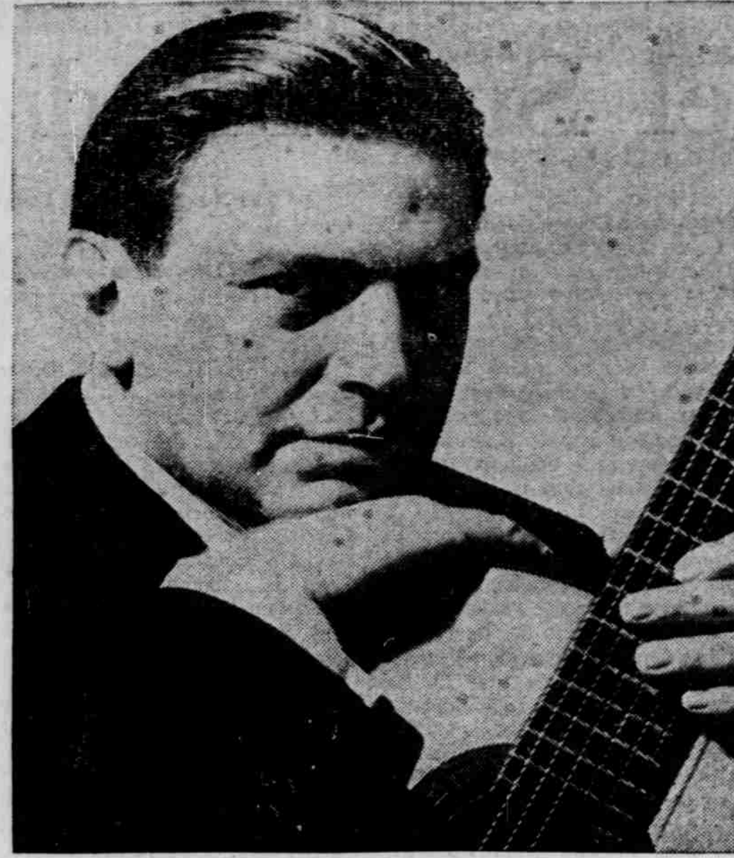
Guitarist Theodore Bikel

ships each year for UNC students. One of them goes to a junior and the other goes to the senior who held the award the previous year.