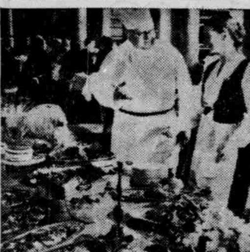
Learning about a European buffet.

Winston Warts (w) 1, Craige B Bulldogs 0 (ftt.) Grimes Gallants II (w) 1, Parker Peons (w) 0, (ftt.) Manly Rats (w) 9, Stacy Stars (w) 6 Alexander Bunnies (w) 8, Mangum Mustangs (w) 0 Lewis Ladrons 14, Parker Pack (w) 6 Ehringhaus B (w) 1, Craige B Bombers (w) 0, (ftt.) Joyner Supporters (w) 25, Teague I (w) 7 Everrett Crossmen (w) 17, Winston Cockroaches (w) 0 Grimes Gems (w) 43, Old East (w) 0 Joyner Kats (w) 6, Lewis Leathernecks (w) 0 Ehringhaus D Rebels (w) 1, Craige A Hors 0, (ftt.)