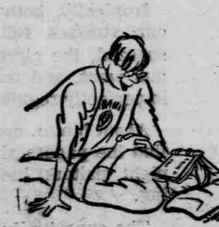
6. If you really want to be practical, why don't you get a Living Insurance policy from Equitable—and give her security. That way, when you get married, you'll know that she and the kids will always be provided for if something should happen to you.