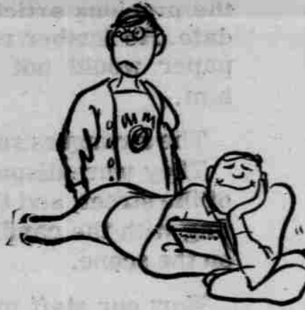
4. Isn't that overdoing it a bit?