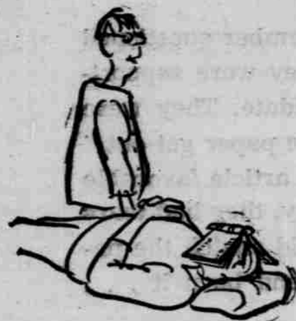
1. Hitting the books?