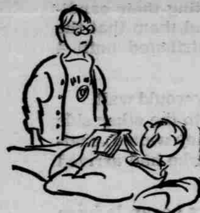
3. You give a gift every week?

We've known each other three full weeks.