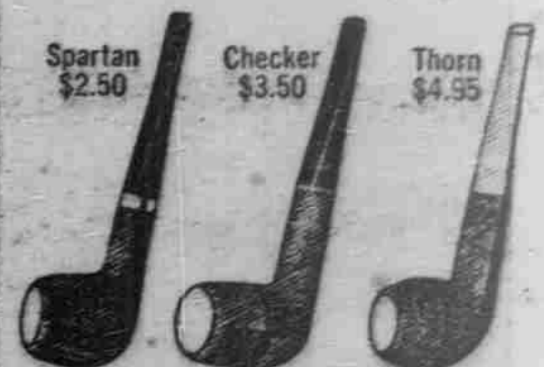
Official Pipes New York World's Fair

No matter what you smoke you'll like Yello-Bole. The new formula, honey lining insures Instant Mildness; protects the imported briar bowl—so completely, it's guaranteed against burn out for life. Why not change your smoking habits the easy way—the Yello-Bole way. $2.50 to $6.95.