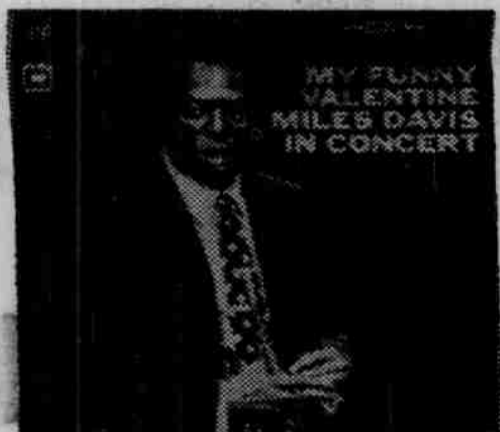
CL 2306/CS 9106 Stereo

A captivating collection of folk ballads — from the poignant to the rousing — including "House of the Rising Sun," "Somewhere," "The Honey Wind Blows," "Cleanso" and 8 more.