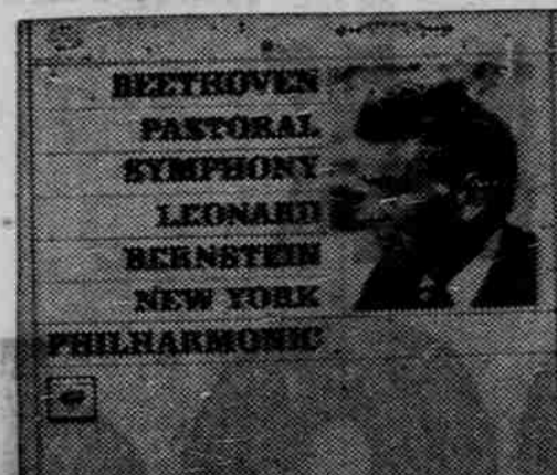
ML 5949/MS 6549 Stereo

Columbia's new, exciting folk artist has a new LP this month called "It's a Dog's Life."