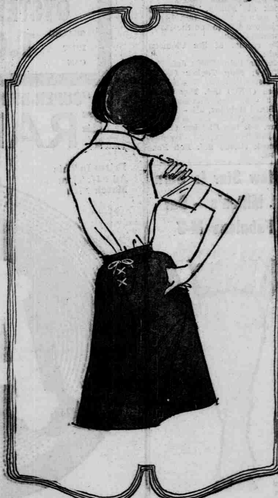
pert surfer skirt . . .

Sailor look that brings backhanded compliments! Feminine and crisp cotton Sufitone A-liner with white sailor lacing in back and big patch pocket in front. Old Salem® makes it in blue or red, sizes 5-15.