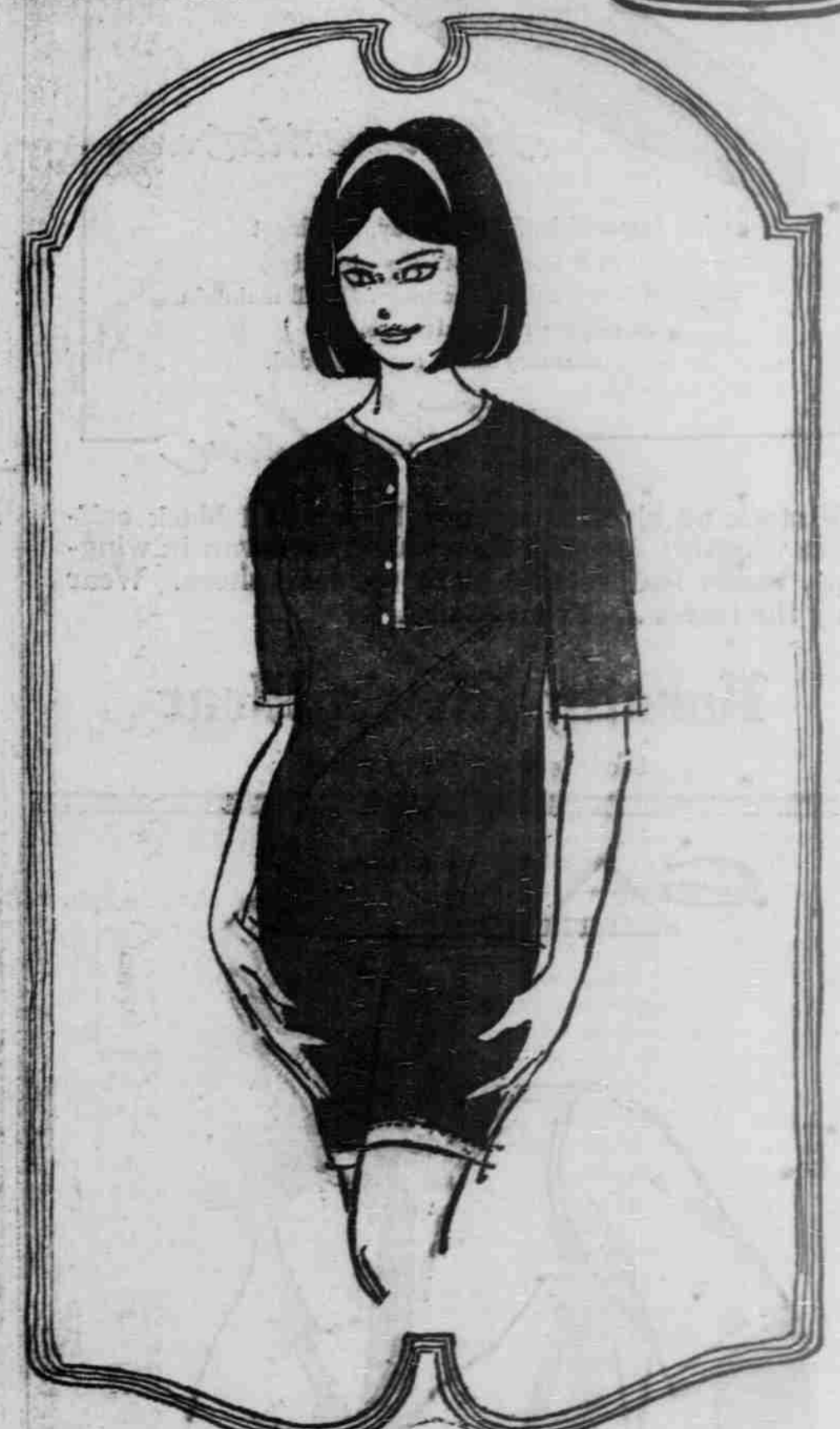
the surfer top . . .

Sailor look that brings backhanded compliments! Feminine and crisp cotton Sufitone A-liner with white sailor lacing in back and big patch pocket in front. Old Salem® makes it in blue or red, sizes 5-15.