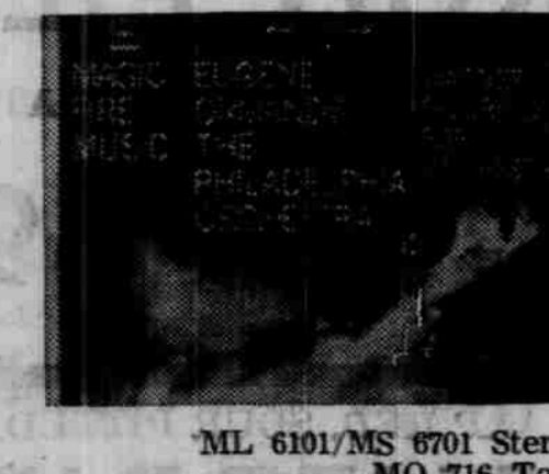
ML 6101/MS 6701 Stereo MQ 716 Tape

Copland's "Concerto for Piano and Orchestra" and "Music for the Theatre (Suite in Five Parts for Small Orchestra)." Aaron Copland, piano, with Leonard Bernstein and the New York Philharmonic. "A brilliant symphonic work." —N. L. Herald Tribune.