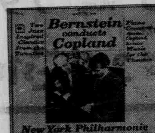
ML 6098/MS 6698 Stereo

Rudolph Serkin, piano, with Eugene Ormandy and the Philadelphia Orchestra in an outstanding performance of Schumann's Piano Concerto in A Minor ("an impassioned reading" —Washington Post) and "Konzertstück" ("an absorbing experience" —N. Y. Times).