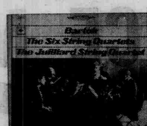
D3L 317/D3S 717 Stereo (A 3-Record Set)

"One of the most imaginative performances within memory" the N. Y. Post said of Leonard Bernstein and the New York Philharmonic's vivid interpretation of the lovely sixth symphony of Beethoven—the "Pastoral."