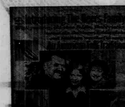
ML 6105/MS 6705 Stereo

A spell-binding program of Wagnerian excerpts excitingly performed by Eugene Ormandy and the Philadelphia Orchestra. "Magic Fire Music" and "Ride of the Valkyries" (Die Walkure); "Prelude to Act III" (Lohengren); Overture and "Festmarsch" (Tannhauser); and "Liebestodt" (Tristan und Isolde).