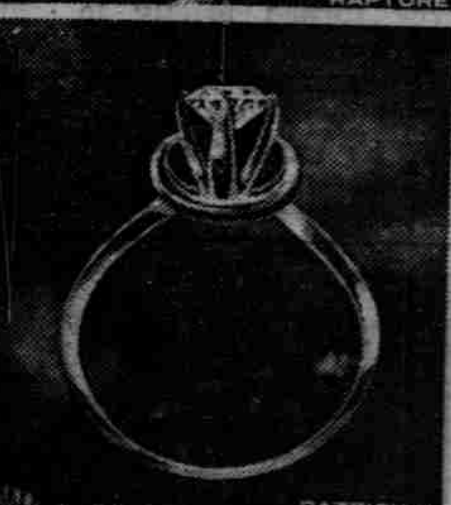
PATRICIAN RINGS ENLARGED

See Dream Diamond Rings only at these Authorized ArtCarved Jewelers