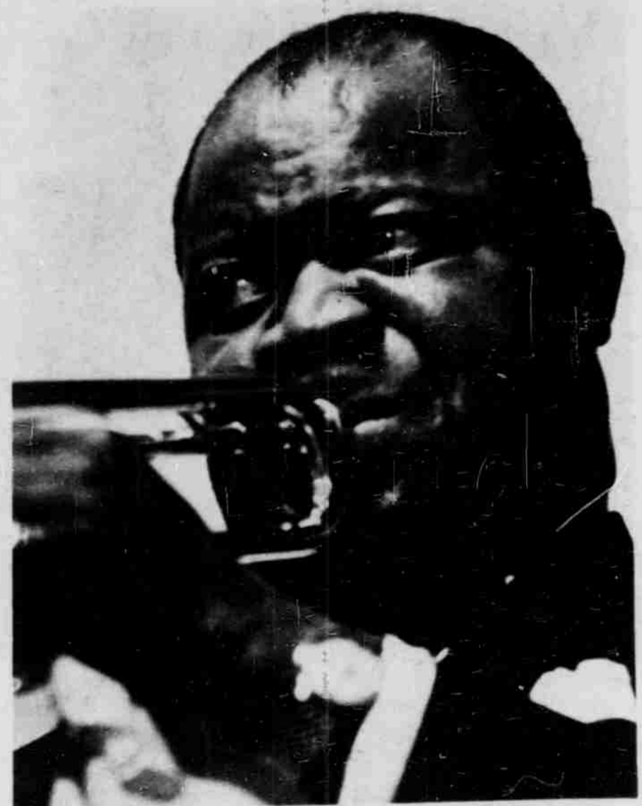
Louis Armstrong: Blaring Out Blues

Graham Memorial hours are 9 a.m. to 11 p.m. Sunday to Thursday, and 9 a.m. to midnight Friday and Saturday.