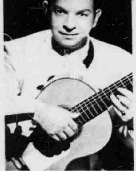
NANCY WILSON touch of strings

The shows are free to students. The next scheduled program will be Sept. 29 when Graham