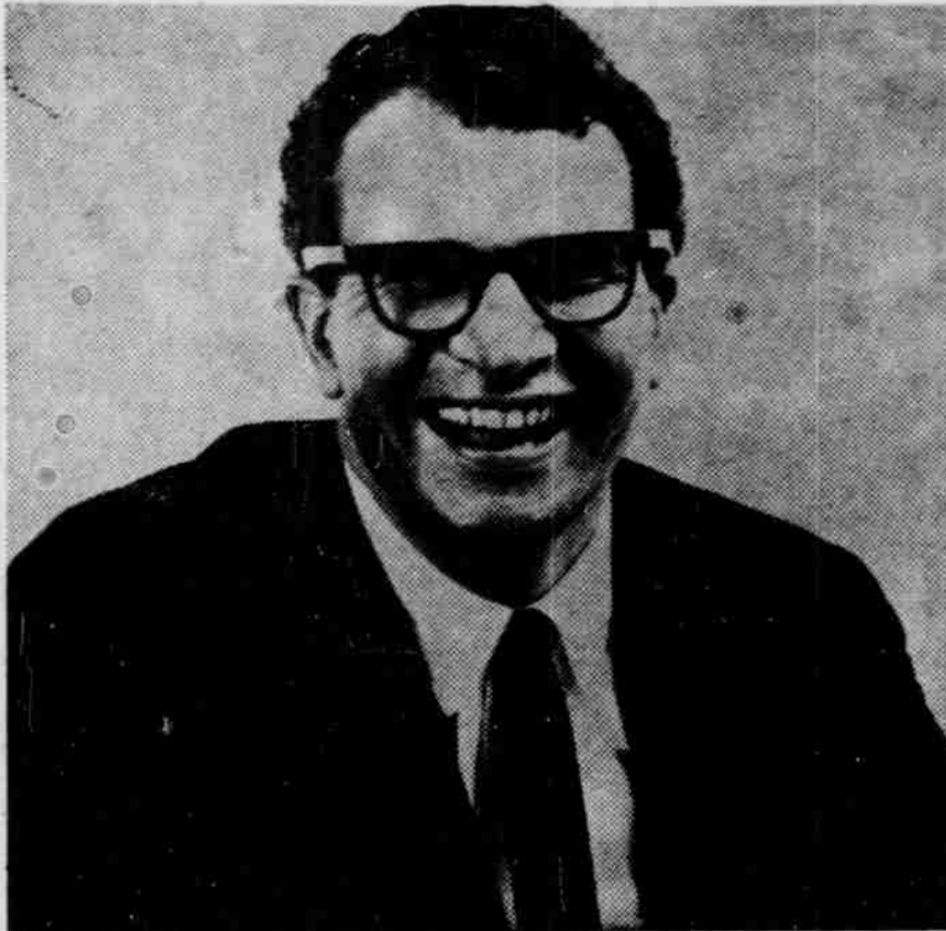
Dave Brubeck—The Jazz Man Cometh