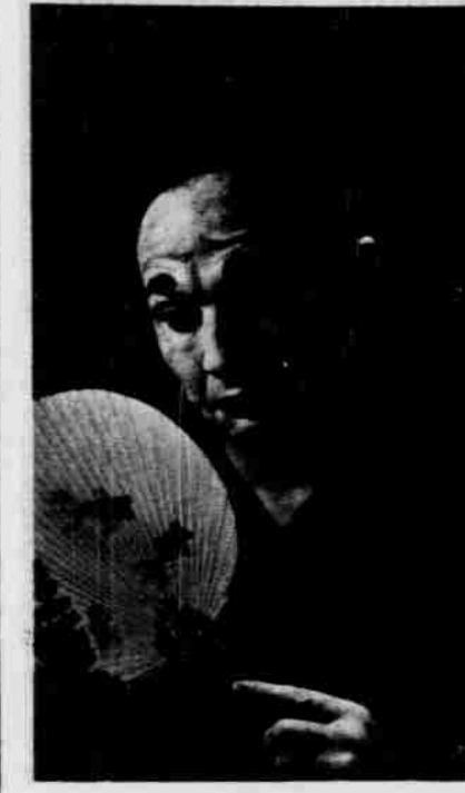
WALTER SMITH as Ko-Ko (1965)