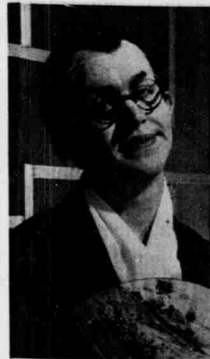
ANDY GRIFFITH as Ko-Ko (1948)

Season tickets for the year's five major productions are still available.