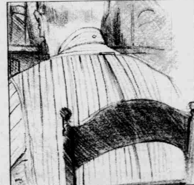
on superior oxford...