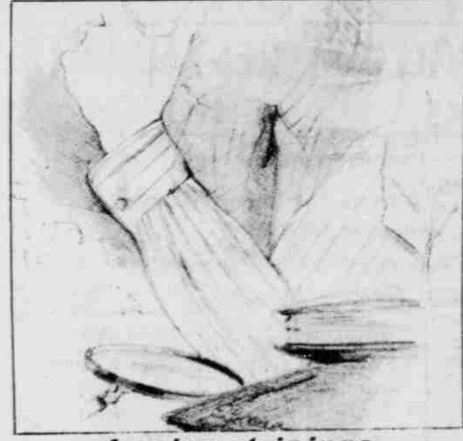
of color stripings...