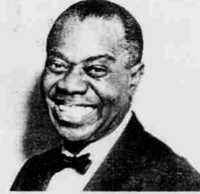
THESE ARE THE SUPREMES (Coming Sunday, Nov. 21, 1:30)

This is LOUIS ARMSTRONG (Coming Sat., Nov. 20, 8 p.m.)