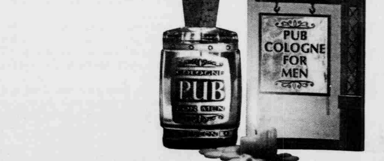
Pub cologne, after-shave, and cologne spray. $3.75 to $10.00. Created for men by Revlon.

Uncork a flask of Pub Cologne. If you hear tankards clash and songs turn bawdy, if the torches flare and the innkeeper locks up his daughter for the night... it's because you've been into the Pub and unloosed the lusty life.