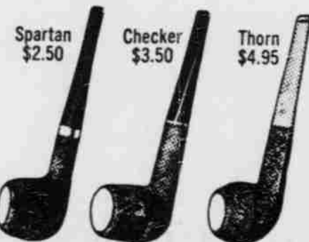
Official Pipes New York World's Fair

No matter what you smoke you'll like Yello-Bole. The new formula, honey lining insures Instant Mildness; protects the imported briar bowl—so completely, it's guaranteed against burn out for life. Why not change your smoking habits the easy way — the Yello-Bole way. $2.50 to $6.95.